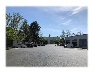
12817 NE Airport Way Building 7 15,025 SF 2,838 SF Office 4 Docks 1 Grade