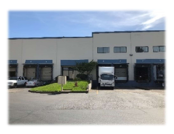
Building 14 9,118 SF 2,016 SF Office 2 Docks 3 Grades